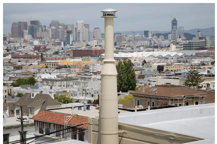
Figure 1. The upper image was shot from fairly close, using a 24mm lens. For the second image, I moved farther back and changed to a more telephoto, 105mm focal length..